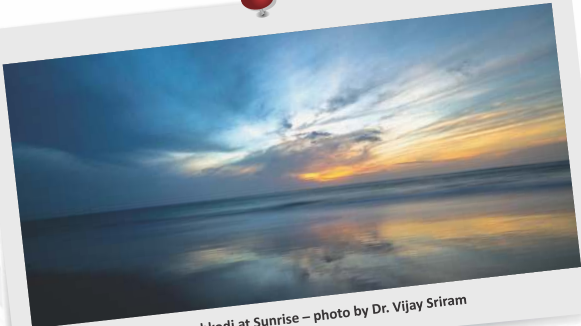
Dhanushkodi at Sunrise

Dhanushkodi is the closest point to Sri Lanka and is now a ghost town. It was a vibrant town till the 1964 cyclone washed the town away with a train and 100-odd passengers on it. This photo was shot at 5.55am using a wide-angle lens attached to a DSLR mounted on a tripod with an ND8 filter attached. This slows down the shutter speed and gives the silken feel to the water.