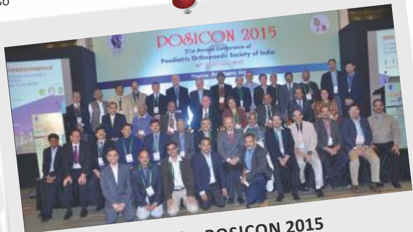
Faculty for POSICON 2015