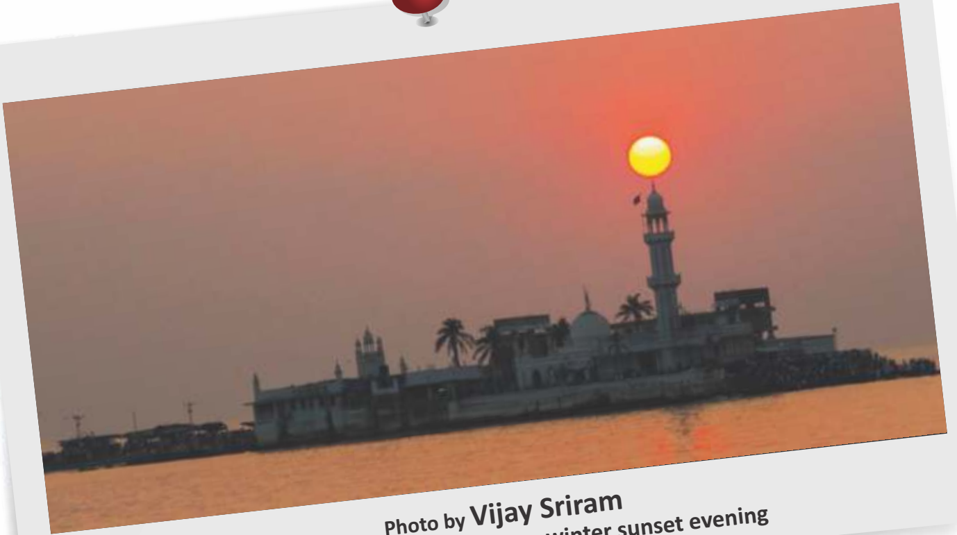
Haji Ali dargah, Mumbai on a winter sunset evening