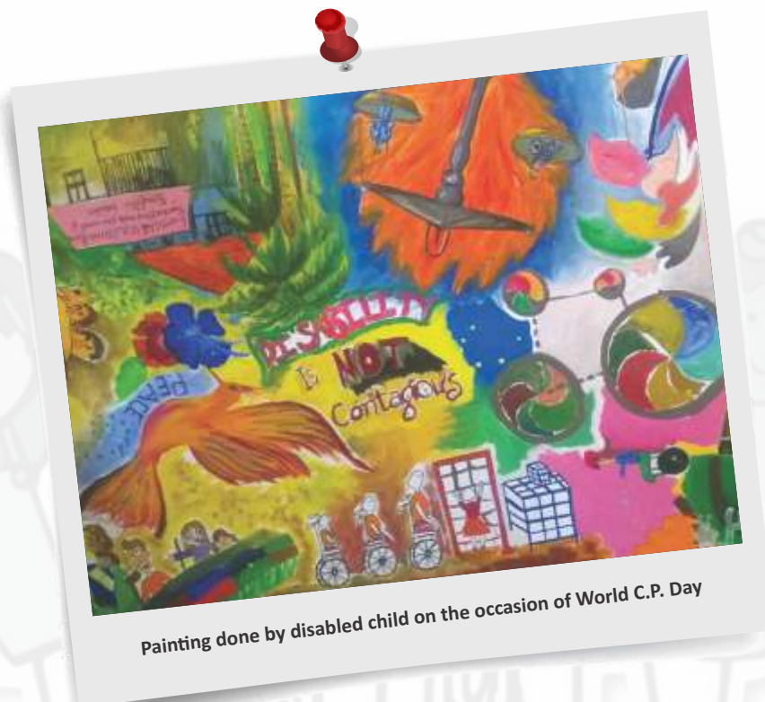
Painting done by disabled child on the occasion of World C.P. Day